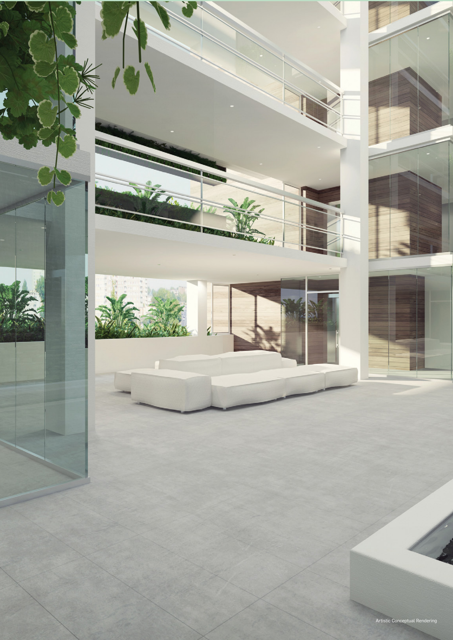
Artistic Conceptual Rendering