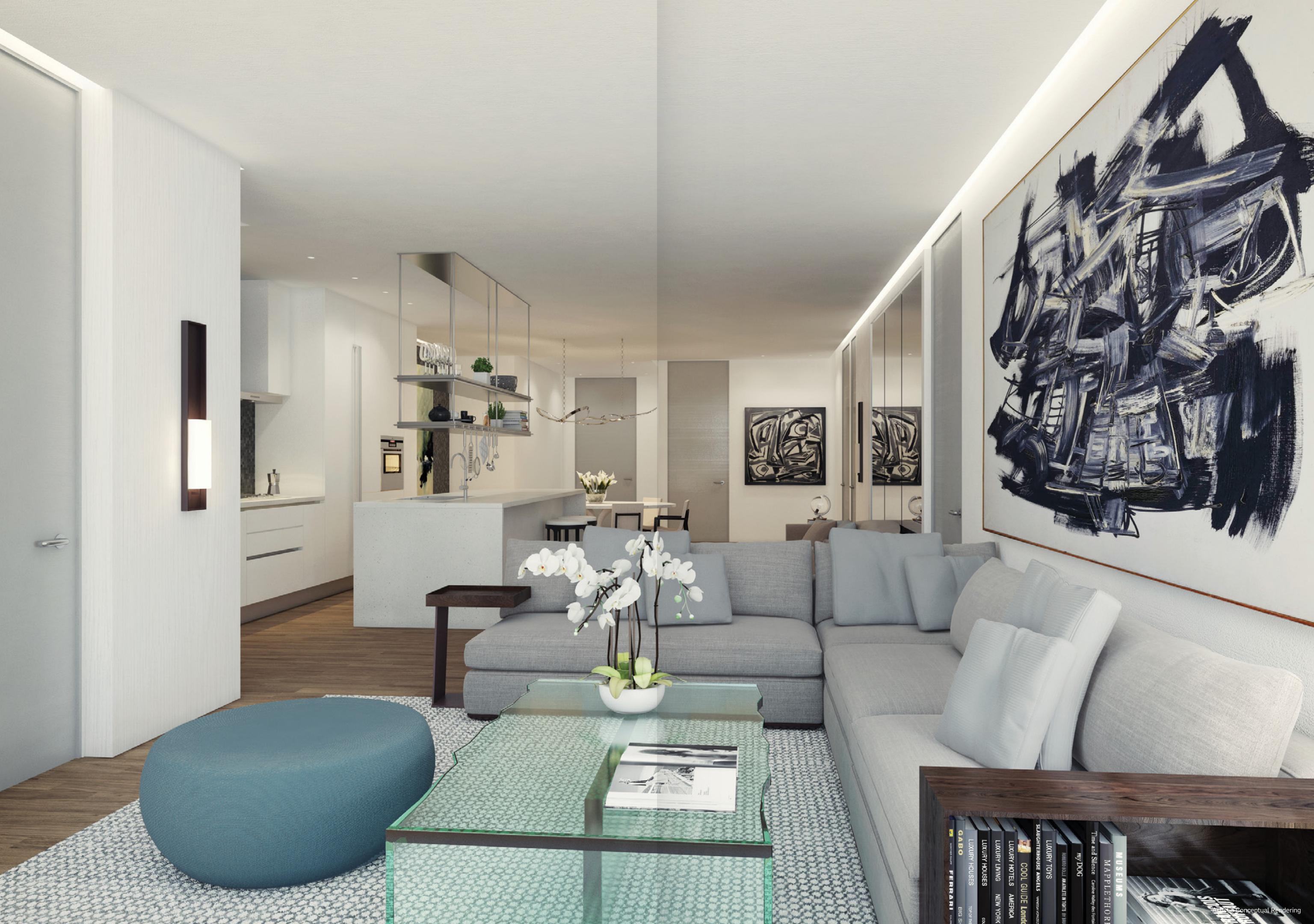
The Living Room