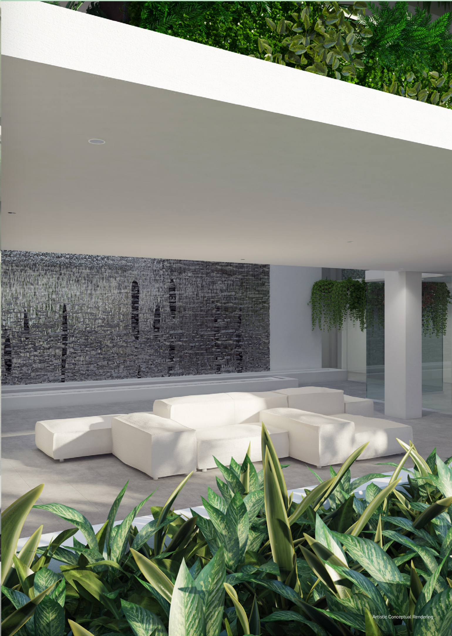
Artistic Conceptual Rendering